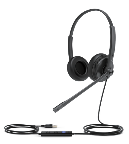
UH34/UH34 Lite Dual Teams UH34/UH34 Lite Dual UC