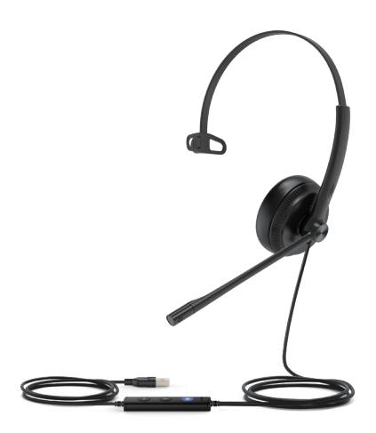
UH34/UH34 Lite Mono Teams UH34/UH34 Lite Mono UC

The hand-held controller with LED indicator provides easier access to key call control capabilities, including answer call, end call, reject call, and mute/unmute.